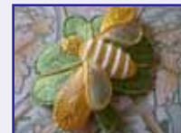
Bee Brooch by Lucy Barter.

Dates: Friday, July 22 and Saturday, July 23 Time: 9:30 am – 3:30 pm Create a gold and pearl bee brooch that includes either a shamrock or poppy. The bee is padded in felt with gold thread and small seed pearls stitched over the body. Fee: $170 members; $200 non-members