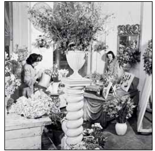
Staff in Spry's shop.

World War II brought hardships but also featured London decked in sandbags decorated with Spry's arrangements. Incongruous pictures of these still exist. Forgiven for her friendship with the Duke and Duchess of Windsor, the commission for Elizabeth II's coronation in 1952 resembled a military campaign, but was