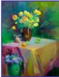
Oranges and Sunflowers , by Elio Camacho.

Fee: $180 members; $215 non-members. Fee includes all materials.