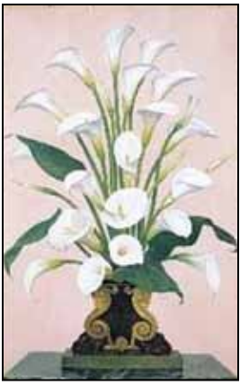
Hannah Gluckstein ("Gluck") painting of a Constance Spry arrangement.

she encouraged the children in her classes to create attractive objects for their homes with their limited materials.