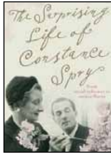
Spry arranging flowers.

A recent biography, The Surprising Life of Constance Spry , chronicles Spry’s journey from a social reformer, who had a ringside seat for Ireland’s Easter Rebellion, to teacher, to floral decorator, to co-owner of London’s Cordon Bleu cooking school, then a school that specialized in teaching young debutantes the “ins and outs” of household management and, finally, floral designer for the coronation of Elizabeth II.