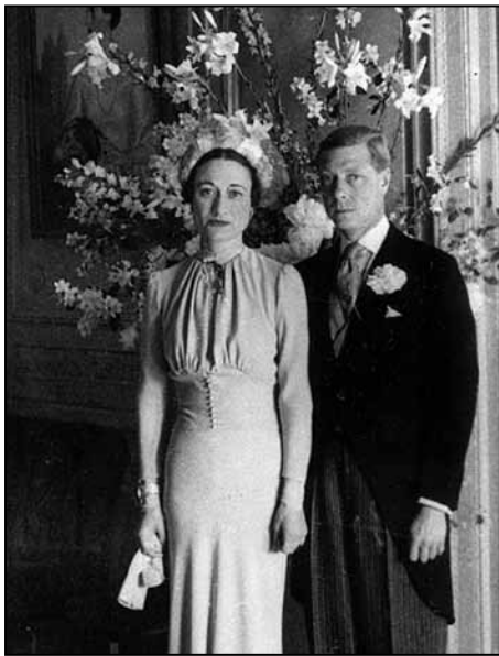
Duke and Duchess of Windsor on their wedding day.